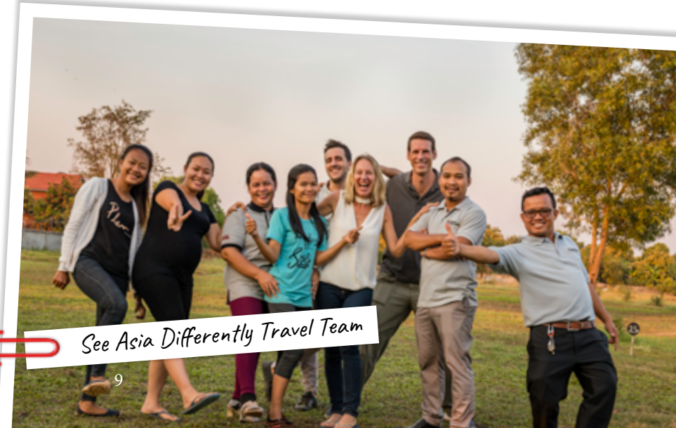
See Asia Differently Travel Team