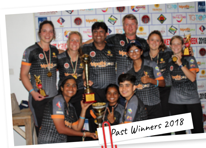
Past Winners 2018

To get to play against such players is such a memorable experience for regular club cricketers and is a huge draw for our tournament as we look to also secure the presence of such players for our tournament in Cambodia.