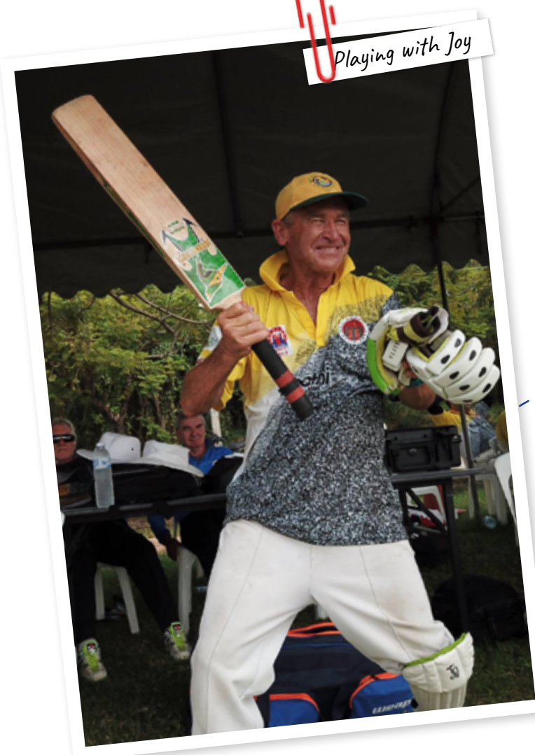
Playing with Joy

The tournament usually consists of between 12 to 24 teams. The results from the first 2 days of play works as a league before splitting the table in to 3 competitions: the cup, bowl or plate. This works extremely well as by the end of the tournament, irrelevant of the standard of your team, you still have to opportunity to walk away with a trophy.