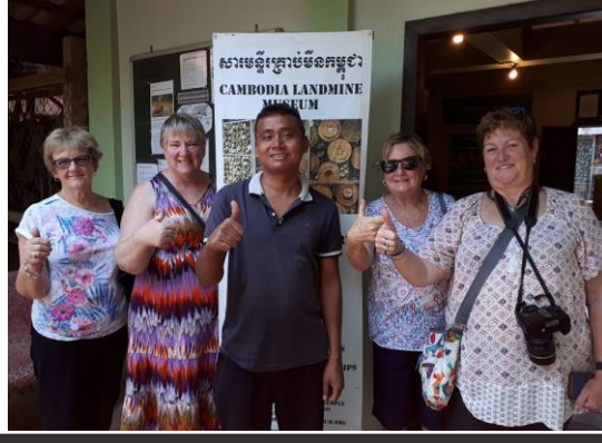
Ra with 4 lucky ladies from America (He was a hit as always)